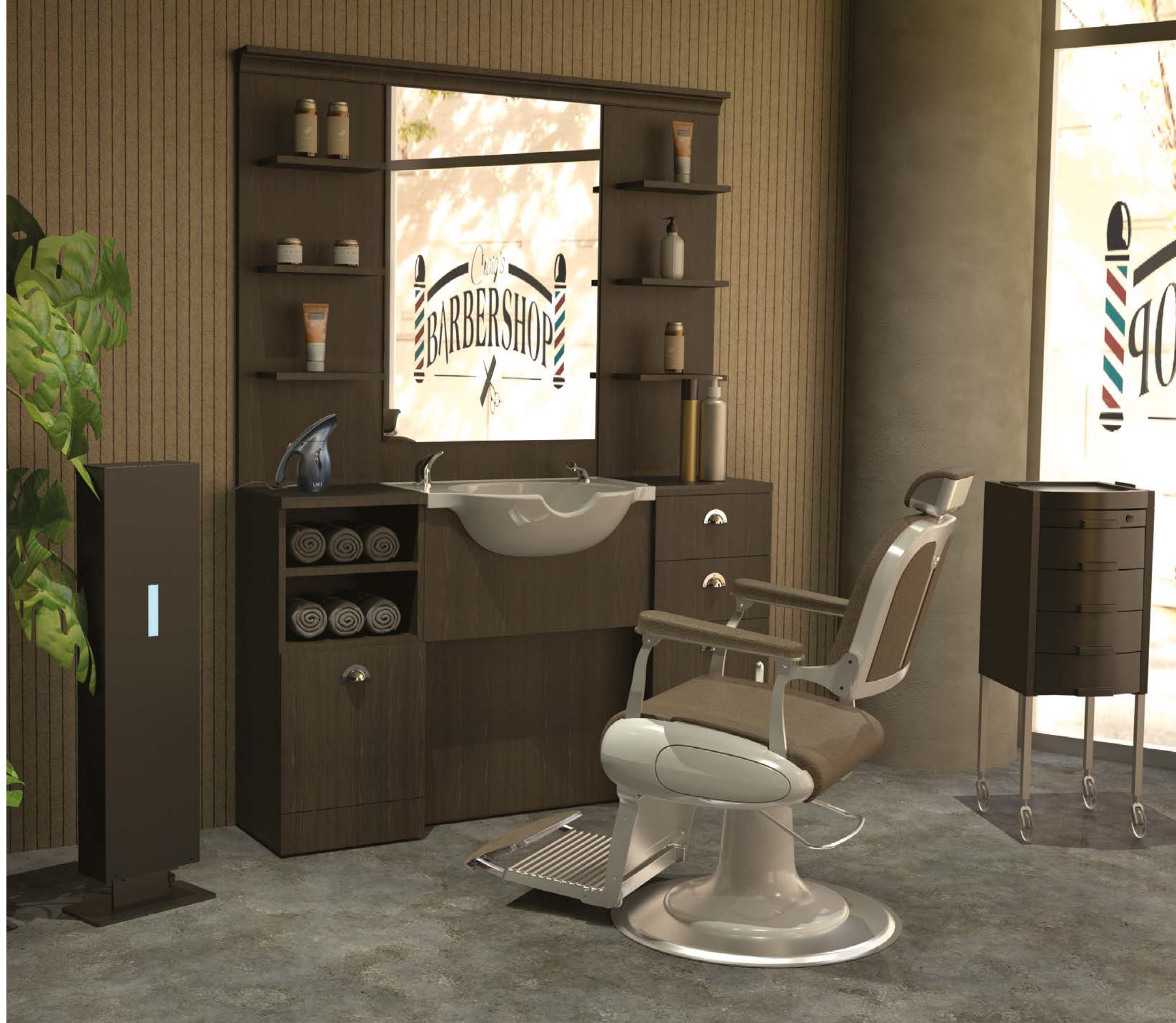
Barber Station + Ecosteam for free

Add character to your space by customising the chair with your logo. The Sequoia version of the Barber station brings masculinity to your salon.