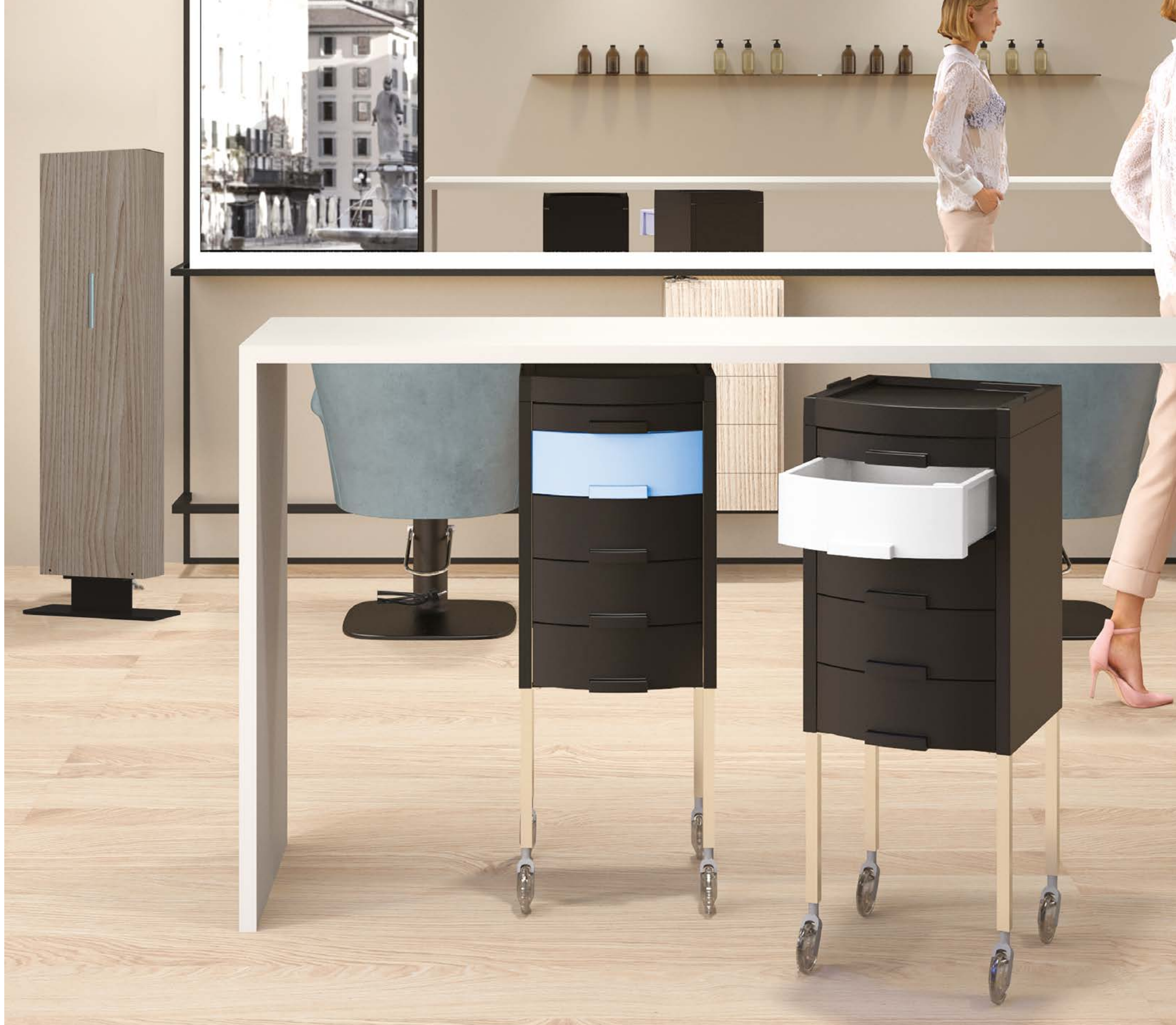
Uvc Totem air sanitizer

Integrated trolley with an uvc ozone free drawer for sterilising work instruments. Service trolley with 3 drawers + 1 sanitising drawer.