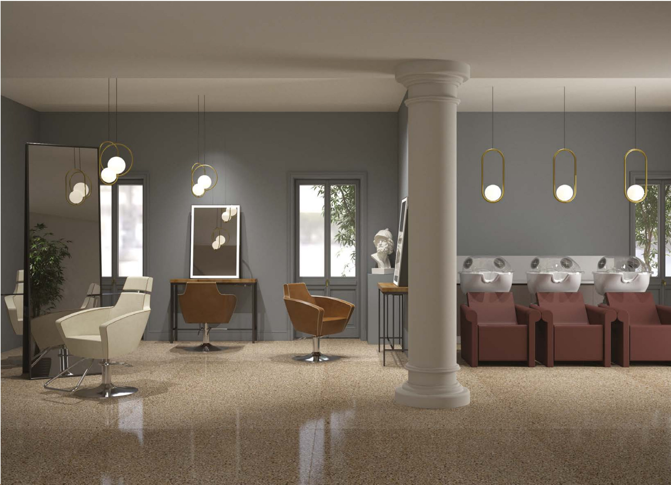
Brooklyn styling unit

Classic colours for Cleopatra , Anita and Anita Rec. in versions with optional piping. The Chelsea + Bowery and Brooklyn styling units, from the New York New York line, add a touch of originality to the salon.