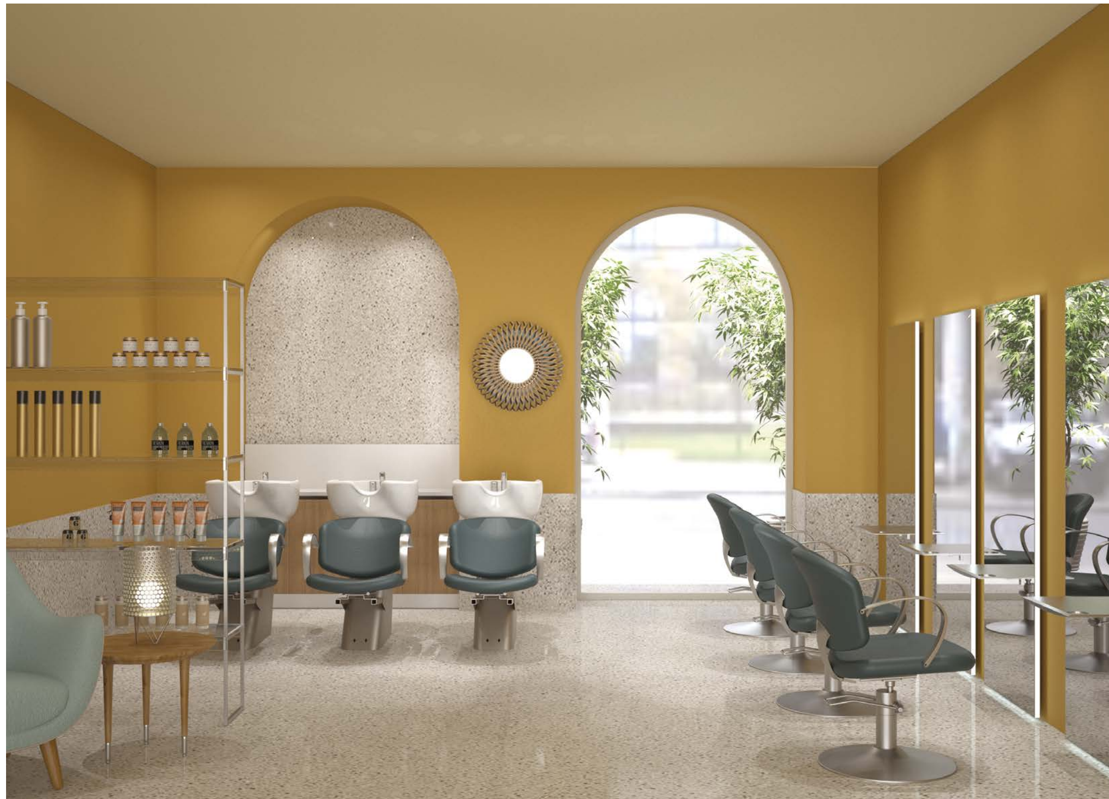
Satin Shell wash unit

The Shell styling chair coordinated with the Satin Shell wash unit, for a classic mood. Combined with the Led New styling unit, they become a Must Have for a bright and trendy salon.